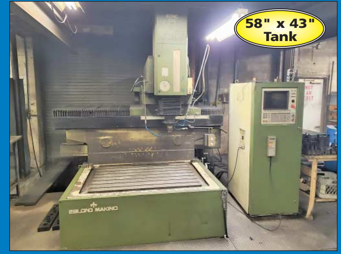
Makino Model EDNC-106 Die Sinker EDM