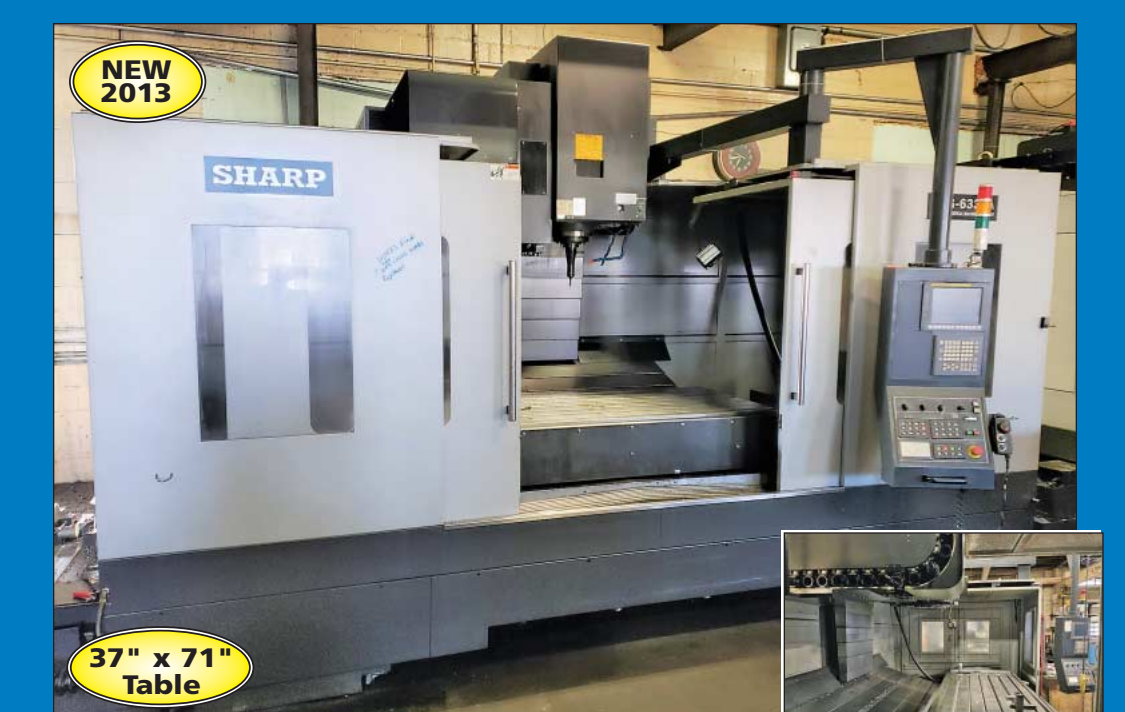
(3) Sharp Model SVG-6335A Heavy Duty CNC VMC's