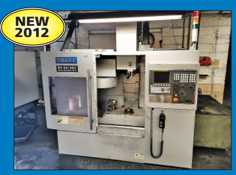
Sharp SV-2414SE CNC VMC