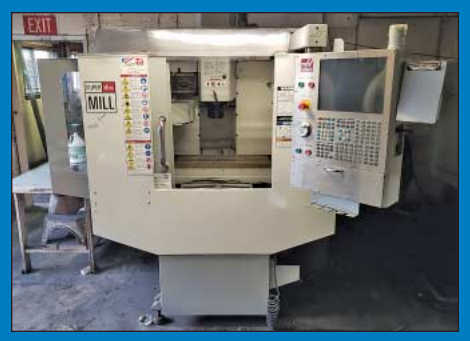
(3) Haas CNC VMC's, VF3, VF0, Mini-Mill