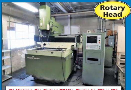
(5) Makino Die Sinker EDM's, Tanks to 58" x 43

To Become See Instructions a Qualified Bidder on Page 4 Bidder on the Internet