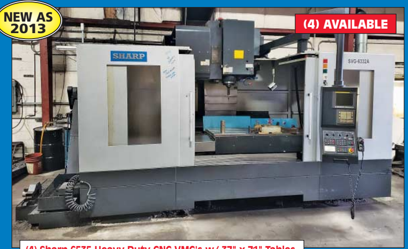
(4) Sharp 6535 Heavy Duty CNC VMC's w/ 37" x 71" Tables

INSPECTION: Day Prior from 10AM to 4PM or by appointment with jeffjr@cia-auction.com