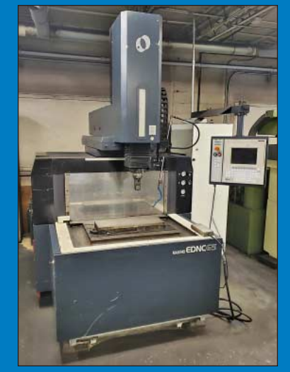
Makino Model EDNC-6 Die Sinker EDM w/ 4th-Axis Rotary Head

(5) 1-HP Bridgeport 8-Sopeed Vertical Mills w/ DRO's