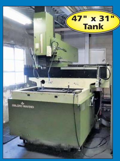
Makino Model EDNC-85 Die Sinker EDM w/ 4th-Axis Rotary Head

x 29" x 17"Area, 31" x 21" Table, X-25.6", Y-17.7", Z-13.8", 16-Pos. ATC, Dielectric Fluid System (New 2000)